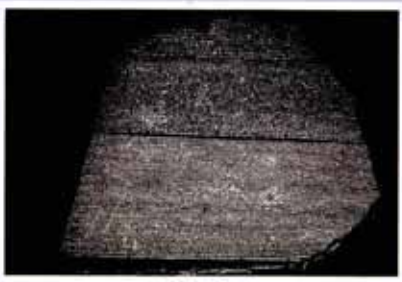
The Rosetta Stone in the British Museum