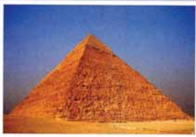
Pyramid of Khafre, Egypt