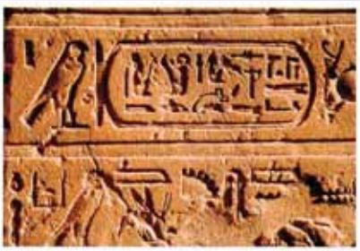
Hieroglyphics at Edfu Temple, Egypt